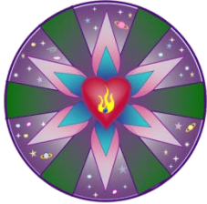
Transformational Breath® Foundation